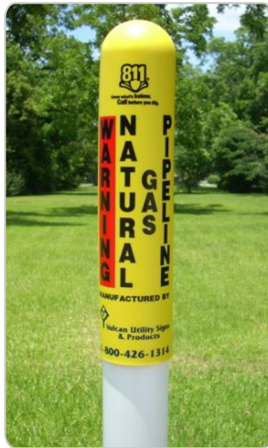
H41 BULLET CATHODIC MARKER WITH SCREEN PRINTED WARNING MESSAGE

Vulcan's H41 Bullet Cathodic Marker utilizes our screen printed Bullet Head top to conceal the test points of the Cathodic leads. This product provides the same "look" as an H41 Bullet Marker and thereby does not draw attention to its importance.