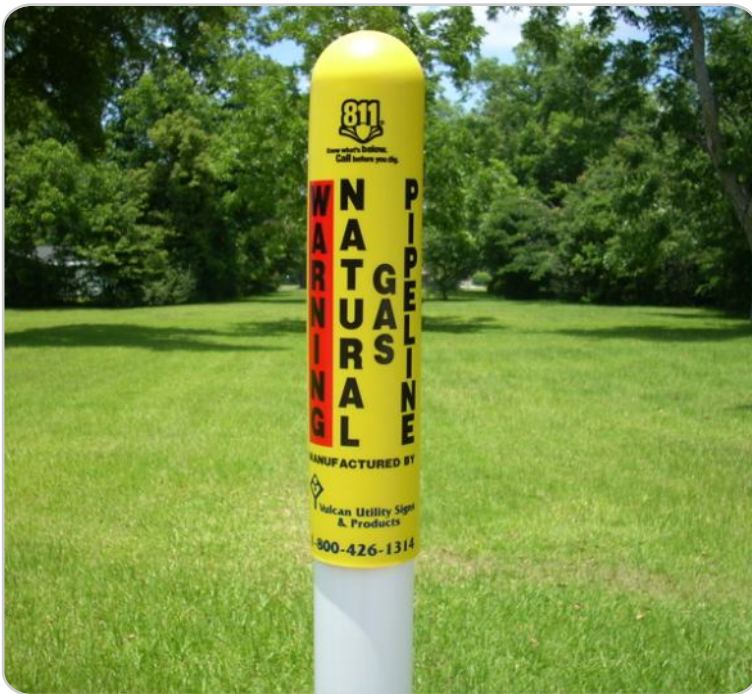
YELLOW SCREEN PRINTED BULLET HEAD ON WHITE POLY POST