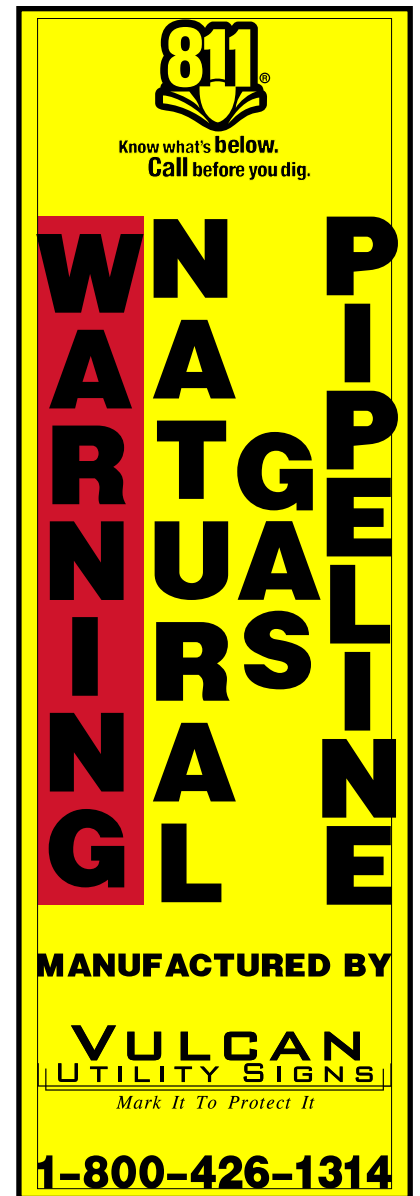
GRAPHIC DETAIL FOR SAMPLE BULLET TOP